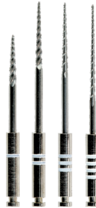
RE RE ENDO ROTARY SYSTEM

Recommended in re-endo procedures in straight or slightly curved canals.