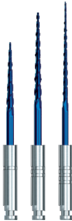
REvision ACTIVE HT technology

Recommended in re-endo procedures in straight, narrow and curved canals.